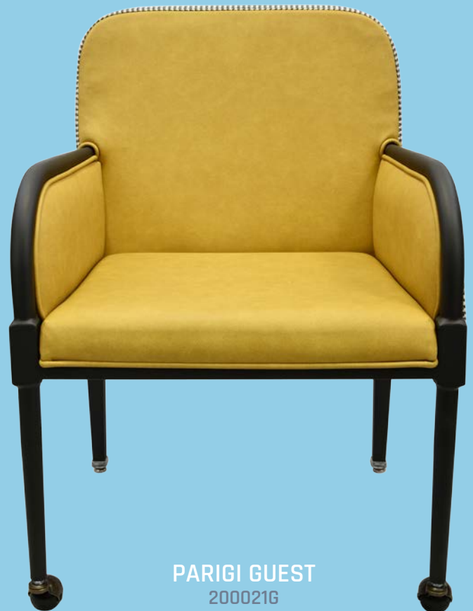
PARIGI GUEST 200021G